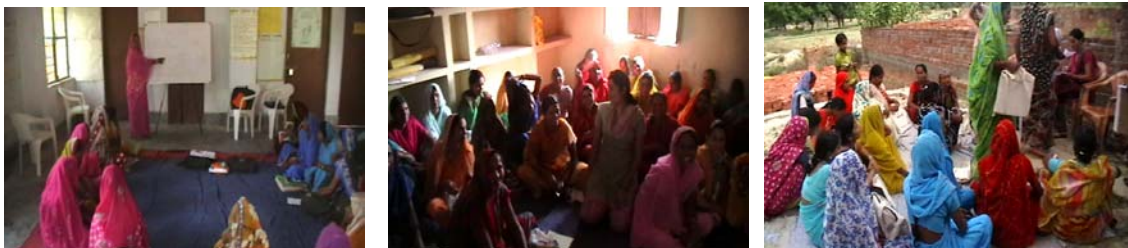
Health volunteers training at a block level