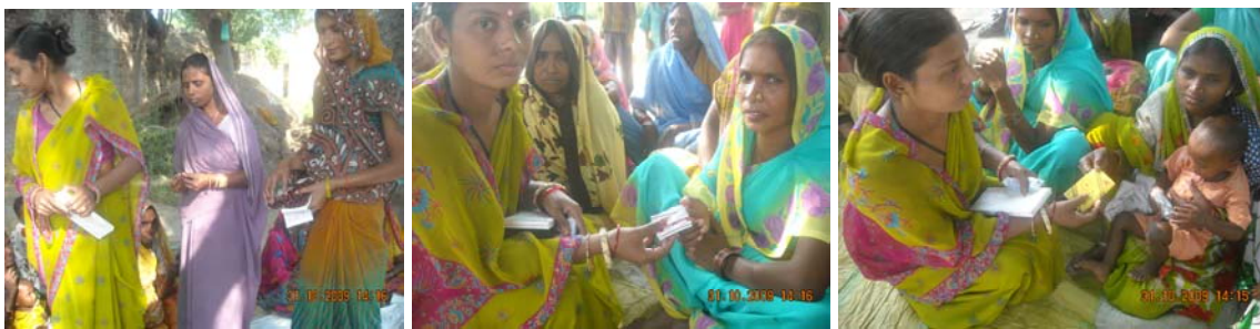
Save-A-Mother Swasthya Sakhis helping in distribution of iron pills and condoms

YouTube: http://www.youtube.com/watch?v=okzRubIaSt8