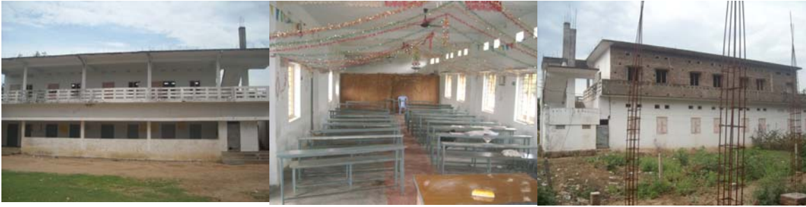
Different views of the Spread India supported facility that is home to many children

Name: Sri Sri Mohanananda Brahmachari Seva Samity Location Binodpur village, Katihar District, Bihar Category: Rural Healthcare